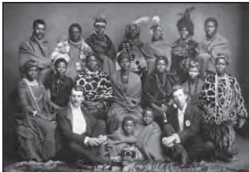
The South African Native Choir, which played Hubbard Hall on May 27, 1894.